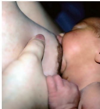
© B. Wilson-Clay/K. Hoover, from The Breastfeeding Atlas , 2008. Used with permission.