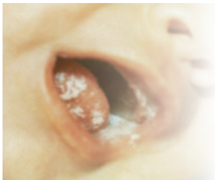
©B.Wilson-Clay/K.Hoover, The Breastfeeding Atlas . Used with permission.