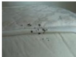
Fecal spots on a mattress

Be aware that not every welt or bite is due to bed bugs. Consult a medical provider with questions about unexplained bites or red welts.