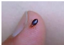
Bed bug on thumb for scale