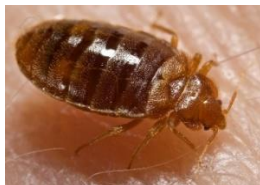
Close up of a bed bug