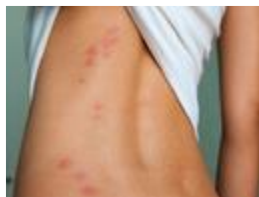
Bed bug bites