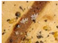
Bed bug eggs and cast skins