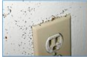
Fecal spots by outlet cover

You may also look for live bed bugs, eggs, and cast skins. Small black or rusty colored spots (blood and fecal spots) found on bed linens, pillows, or mattresses are another sign of an infestation.