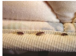
Bed bugs on seam of mattress

Once only found in the bedding of homes and apartment complexes, bed bugs can now be found throughout your community. This handout includes several commonly asked questions and answers regarding bed bugs and how to identify, inspect, and treat for an infestation.