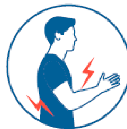
Muscle aches and back aches